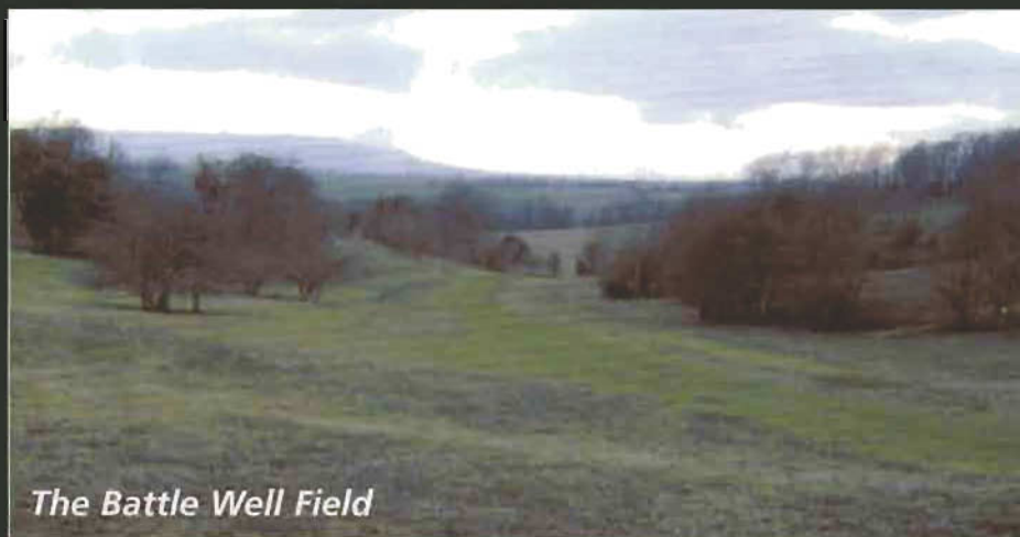
The Battle Well Field

This is a self-guided Trail, clearly signed by waymarked posts, which takes you over the general area where the battle was fought. It simply attempts to show you the lie of the land and leaves you to envisage for yourself what happened here on 4th August 1265. Besides exploring the scene of the battle, we hope this walk will help you to enjoy the beauty of this typical Vale countryside with its extensive orchards – a very important part of Evesham's later history. There are glorious views to Bredon Hill and (on a clear day) the Malverns.